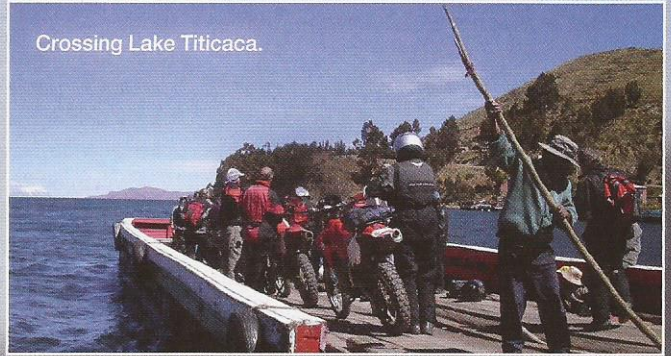
Crossing Lake Titicaca.