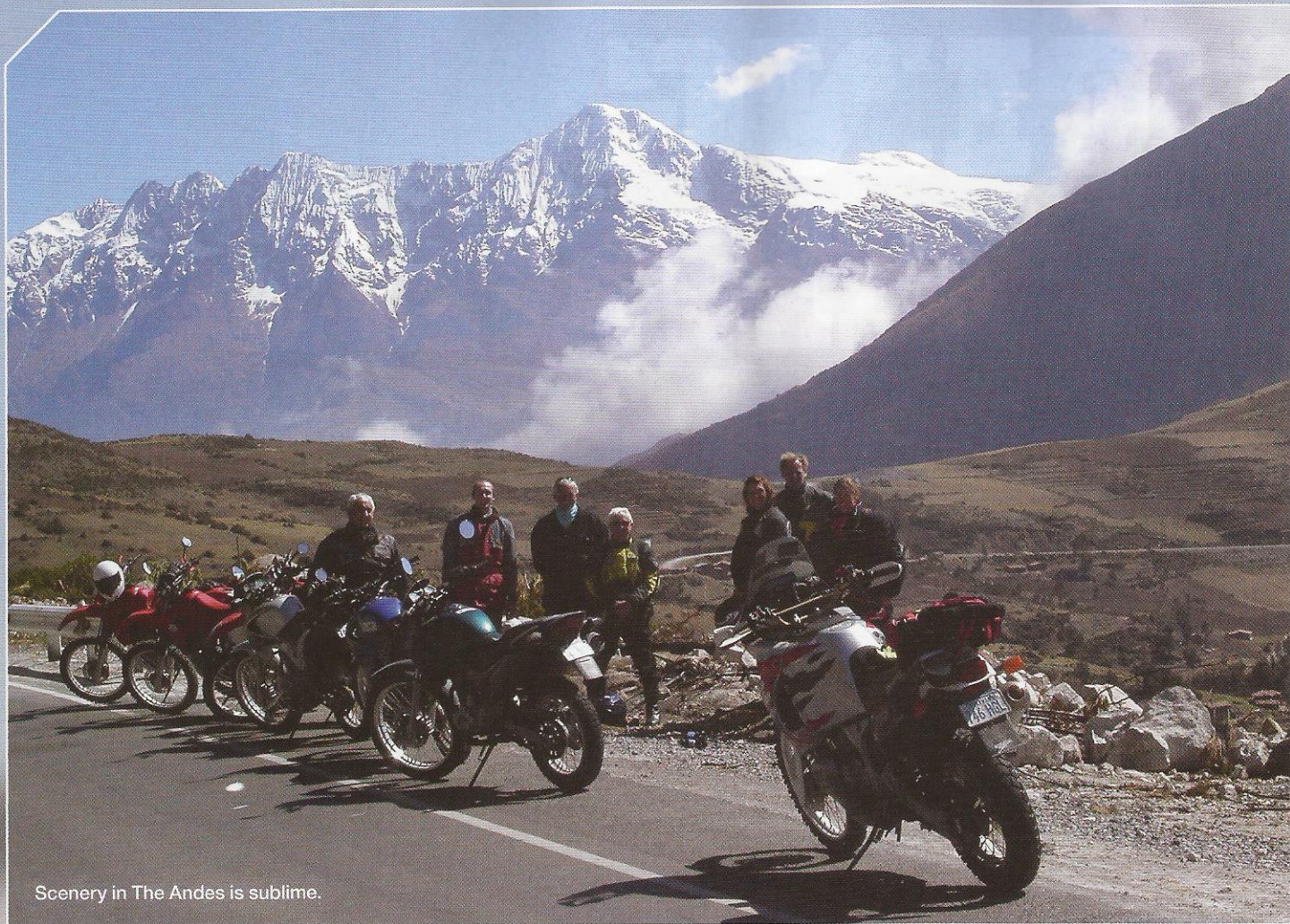
Scenery in The Andes is sublime.

and advised we were free to proceed, but we had no chance of making it to the capital on the highway. The blockades ahead were of a much more determined nature and we would be better off taking to the smaller sidestreets, we were told.