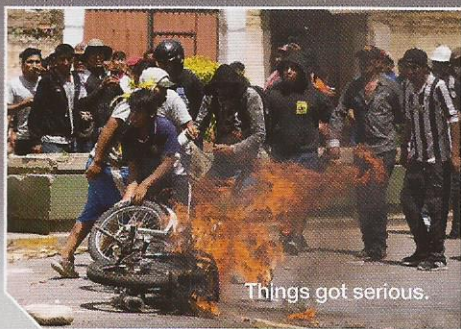
Things got serious.