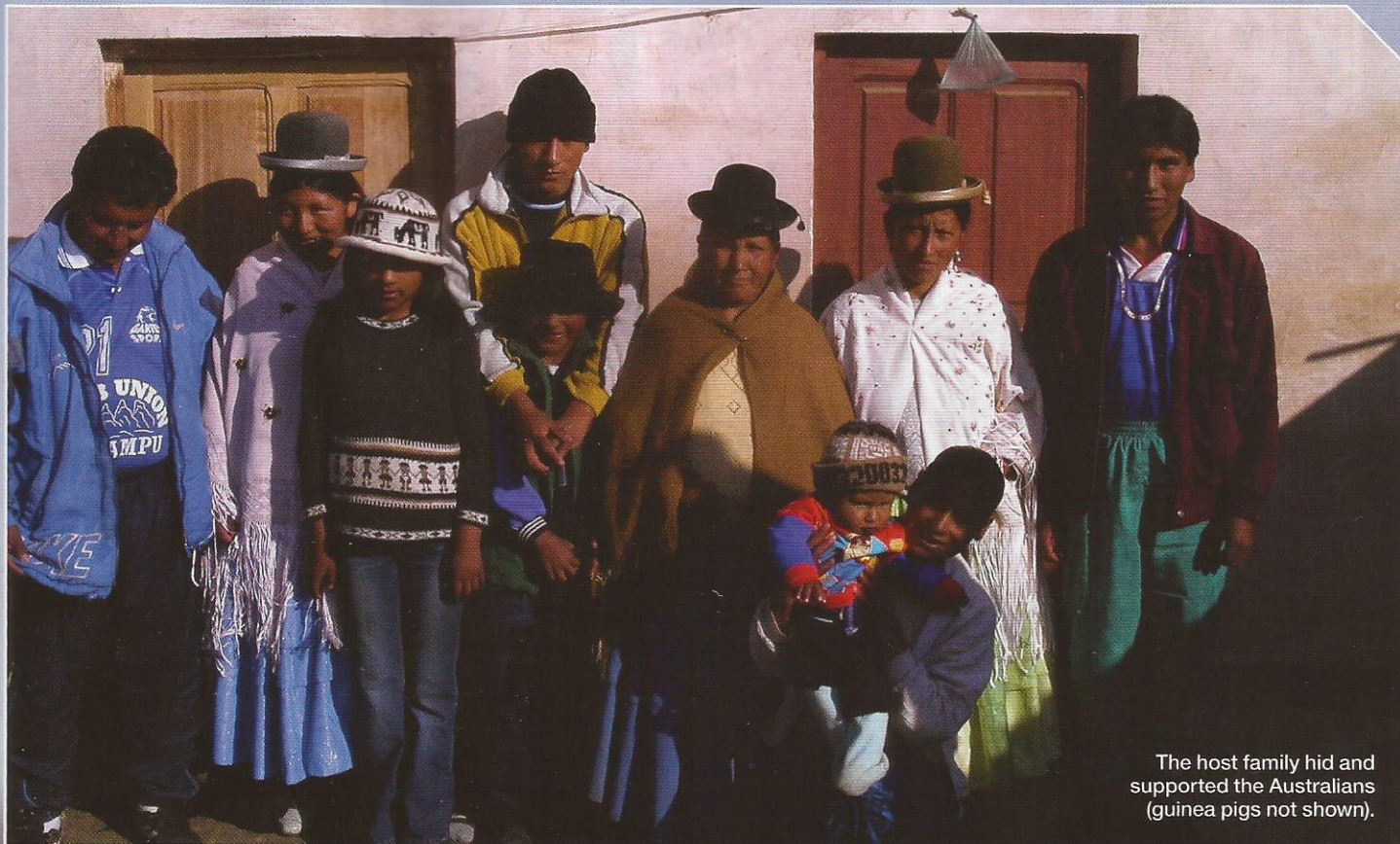
The host family hid and supported the Australians (guinea pigs not shown).