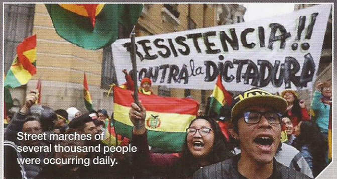
Street marches of several thousand people were occurring daily.