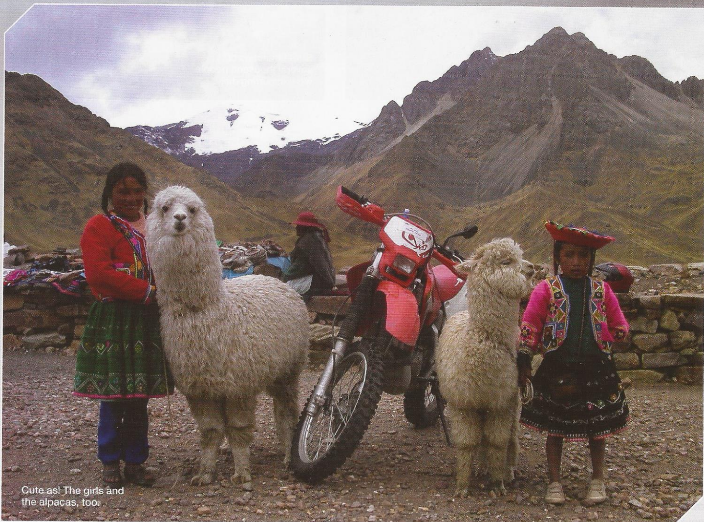
Cute as! The girls and the alpacas, too.

In the end, one of our group had a friend in Sydney who contacted a friend in Melbourne who contacted a friend in Peru who contacted a friend in the Peruvian Air Force who somehow managed, on the evening of Thursday, October 16, to secure seats for