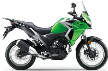
Kawasaki Versys 250