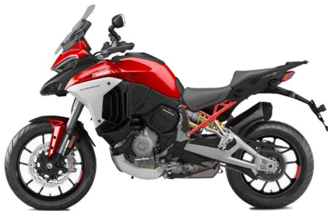
Ducati Multistrada V4 1200